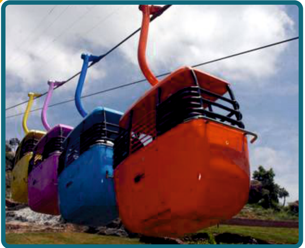
Rope Car Project at Palani

ITCOT is providing PMC services for the state of the art Rope car project at Palani Hills in consortium with M/s Eric, France.