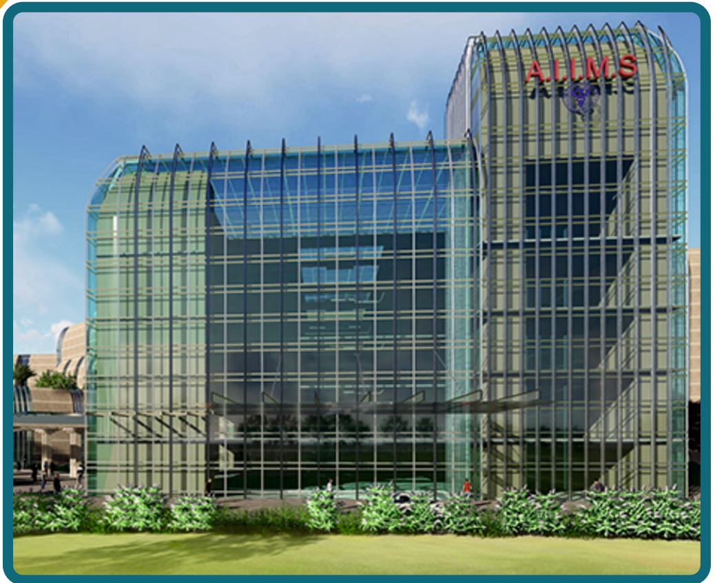
AIIMS at Deogarh, Jarkhand

ITCOT is functioning as the Agency for Specialized Monitoring (ASM) of NKG Infrastructure Limited, New Delhi for consortium of banks led by State Bank of India. NKG is the EPC Contractor for AIIMS, Jarkhand which is one of the projects covered under ASM and monitored by ITCOT.