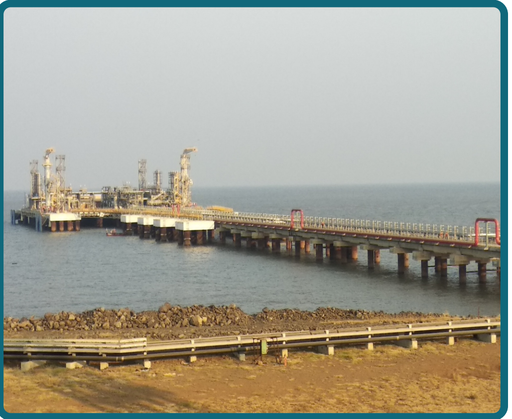
Greenfield LNG Port

SBI has appointed ITCOT as ASM & for LIE services for Greenfield LNG Port project with a capacity of 5 MMTPA LNG regasification facility using a "Floating Storage and Regasification Unit" (FSRU) at Jafrabad Coast in Amreli District, Gujarat for SWAN LNG Pvt., Ltd (SLPL) and Triumph Offshore Pvt., Ltd., The credit exposure for the project is Rs. 4000 crores.