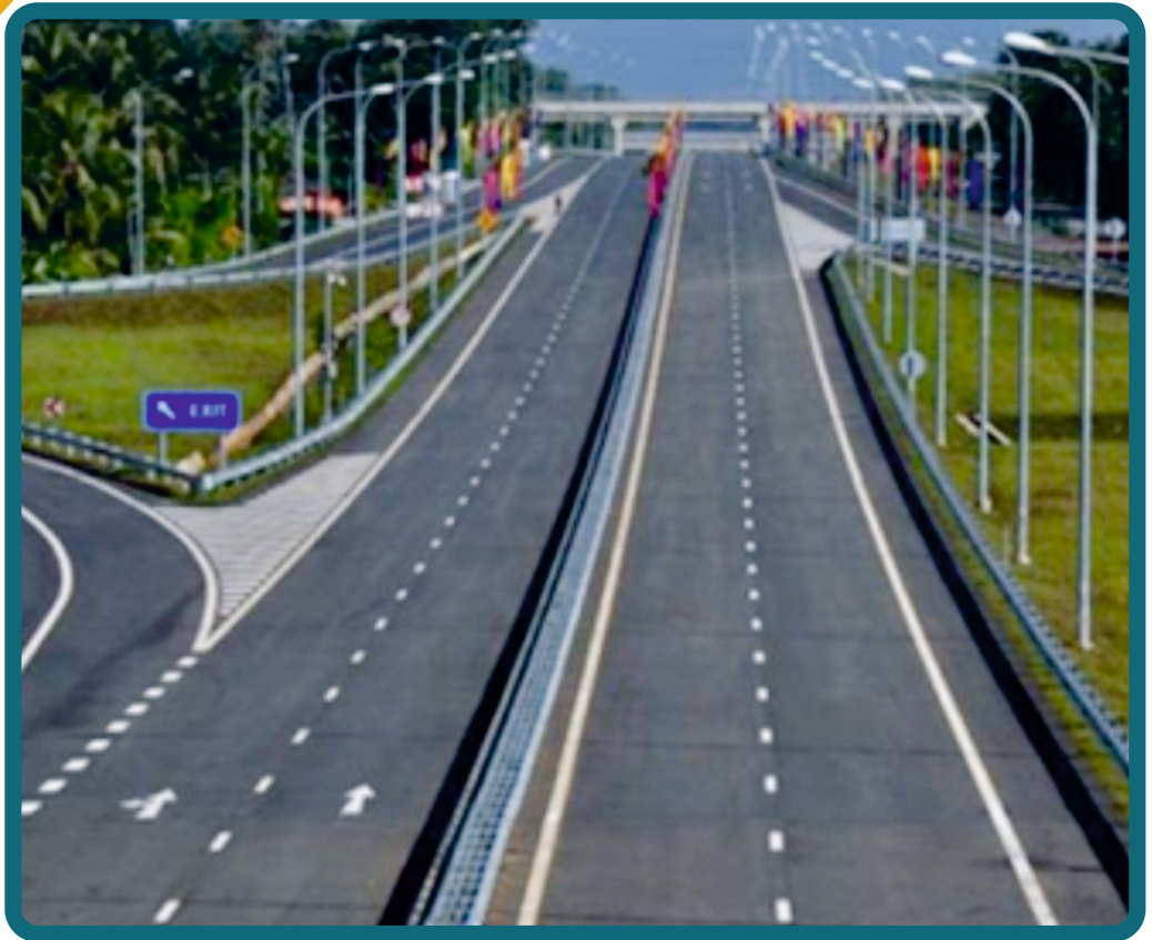
Vadodara –Mumbai Expressway

Union Bank of India, has engaged ITCOT to undertake TEV study on the construction of eight lane Expressway of Vadodara - Mumbai Expressway in the State Gujarat on HAM by Vm7 Expressway Pvt. Ltd., an SPV of IRB Infrastructure Developers Ltd., for a project cost of Rs 1755 crores.