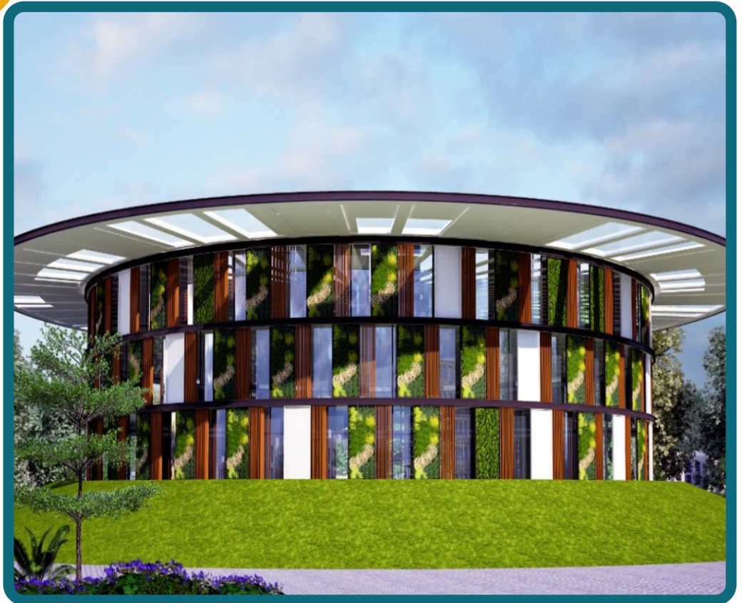
Amma Green Park, Guindy

ITCOT is providing PMC services for establishment of Amma Green Park at Guindy, Chennai being implemented by Tamil Nadu State Agricultural Marketing Board and Tamil Nadu Agricultural University.