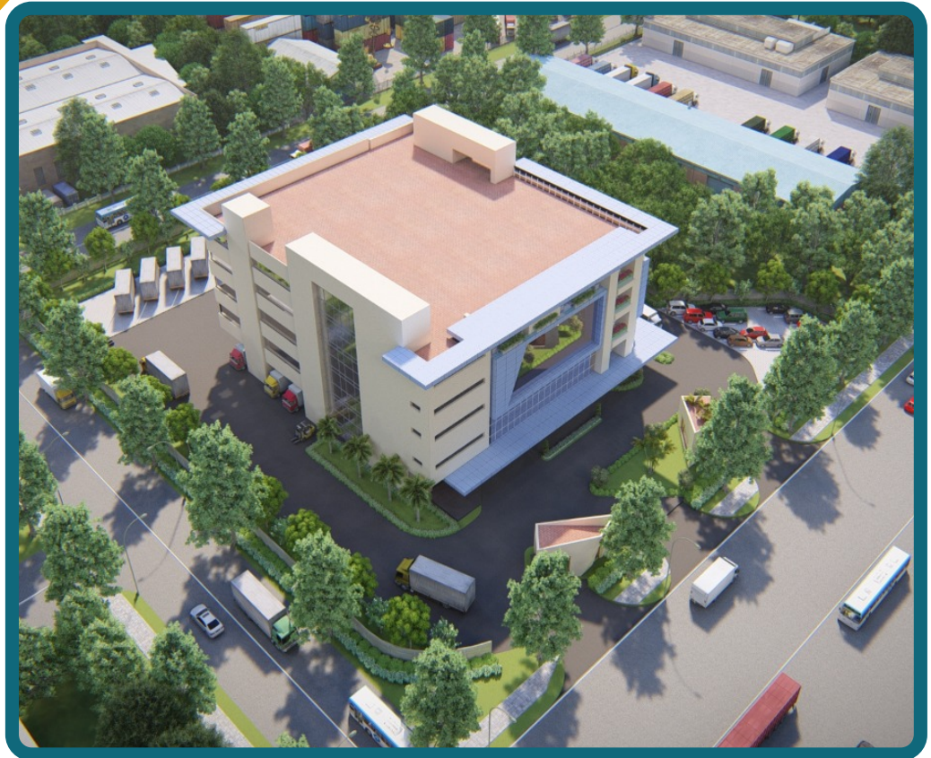
Plug & play facility for Micro Enterprises at Ambattur Industrial Estate

ITCOT prepared the TEFR for setting up of Multi Storied Plug & Play Facility for Micro Enterprises at SIDCO Industrial Estate, Ambattur, Chennai for Tamil Nadu Small Industries Development Corporation Ltd., (TANSIDCO). The project envisages construction of 1.84 lakhs sq. ft for accommodating 130 micro enterprises.