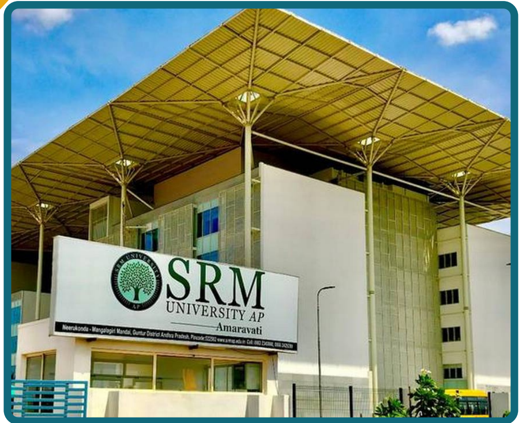
SRM University, AP at Amaravati

ITCOT has prepared the TEV report for SRM University at Amaravati, Andhra Pradesh for availing financial assistance from Indian Bank. The campus is planned to accommodate 17,100 students and 1600 faculties/ staff at a project cost of Rs. 852 crores.