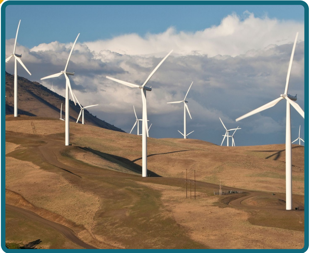
Wind farm in Cuba

ITCOT has provided project financial analysis services for 51 MW Wind farm project in Cuba, Caribbean Islands in association with the Centre for Wind Energy (C-WET). ITCOT has signed an MoU with C-WET for developing non-conventional energy projects.