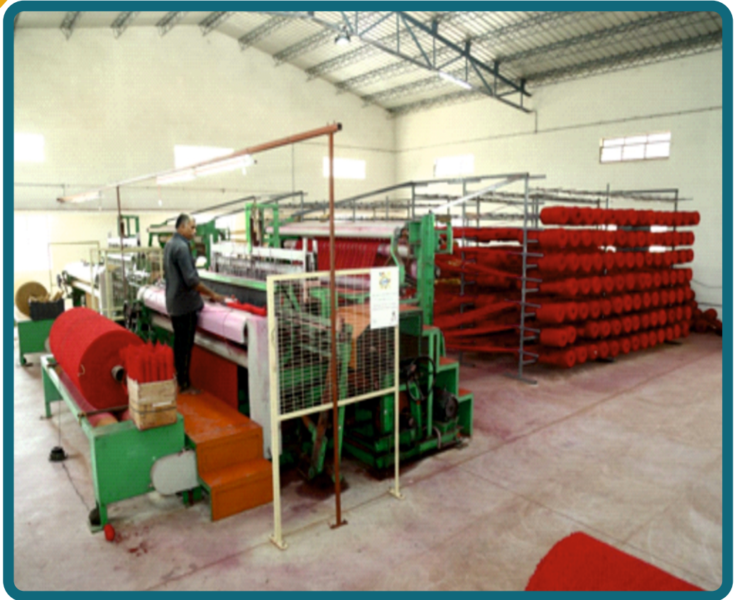
Kangayam Coir Cluster

Kangayam Coir Cluster is one of the coir clusters, supported by ITCOT, in which a CFC has been established for manufacturing Coir mattings and Coir Geo-textiles.